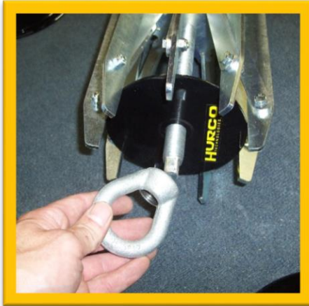
Remove end loop from gauge.