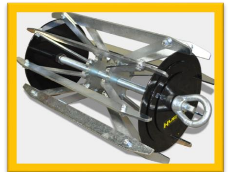
The frame is the carrying case - Store all end plates on the frame when finished testing to eliminate missing plates.