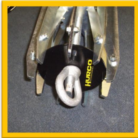
Replace end loops on either side and tighten. Do not over tighten, or it may cause end plates to spiral. Gauge is now ready for deflection testing.