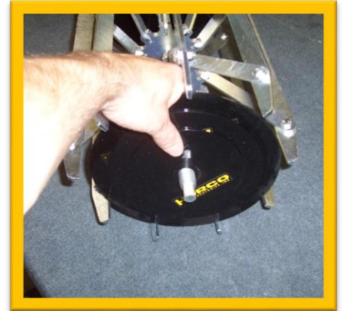
Remove unwanted plate sizes.