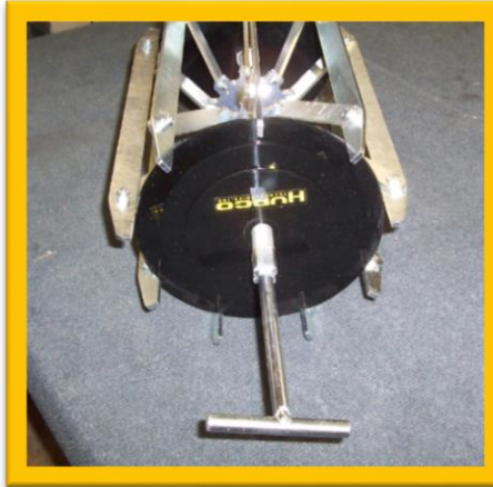
Using the supplied T-handle, place on the end of the threaded rod and turn to open the frame.